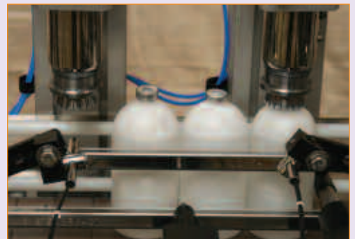
Twin head crimping machine